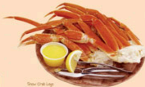
Snow Crab Legs