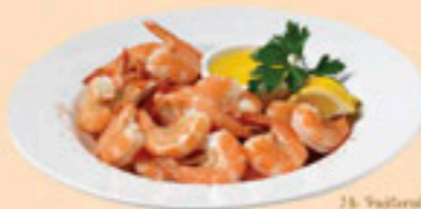
2lb Traditional Steamed Shrimp

(By Our Scale) 1lb FROM THE ICY NORTHERN WATERS, DANGEROUS TO CATCH, FUN TO EAT.