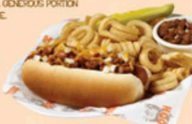
Gourmet Hot Dog Shown All The Way

Served With a Side of Curley fries A WIENER YOU CAN RELISH IT'S LIVED A DOG'S LIFE. Have it "All The Way"