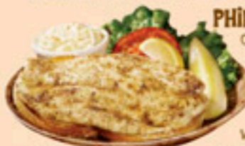
Grilled Groupers Cajun Sandwich

ONIONS, GREEN PEPPERS, MUSHROOMS, PROVOLONE CHEESE. WE HAVE A BIG STEAK IN THIS ONE!