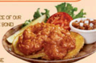
Buffalo Chicken Sandwich

A GRILLED CHICKEN BREAST SMOTHERED IN PROVOLONE CHEESE, ONIONS, GREEN PEPPERS AND MUSHROOMS.