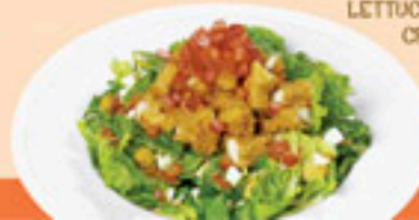
Hooters Cobb Salad